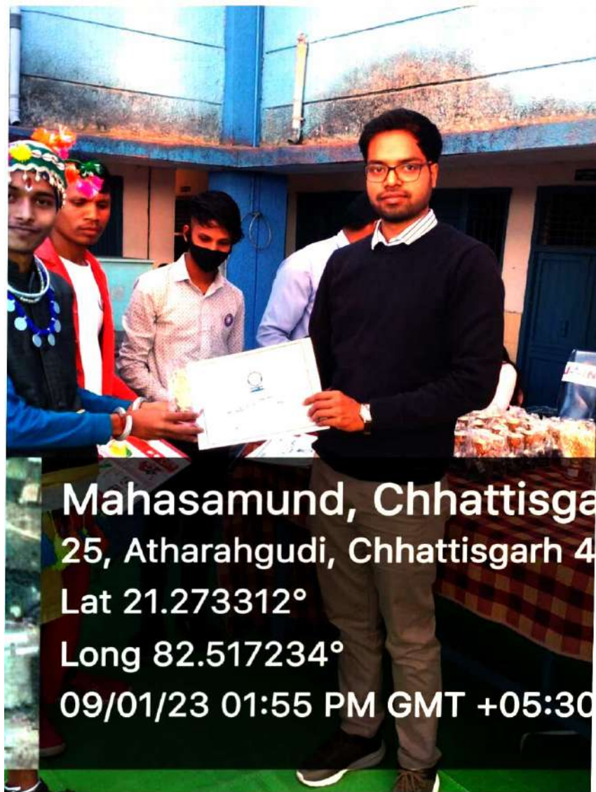
Mahasamund, Chhattisgarh 25, Atharahgudi, Chhattisgarh 4 Lat 21.273312° Long 82.517234° 09/01/23 01:55 PM GMT +05:30