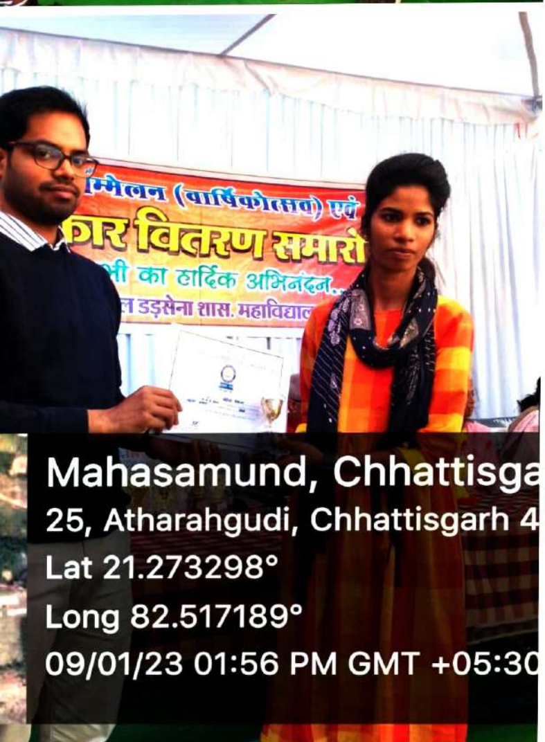
Mahasamund, Chhattisgarh 25, Atharahgudi, Chhattisgarh 4 Lat 21.273298° Long 82.517189° 09/01/23 01:56 PM GMT +05:30