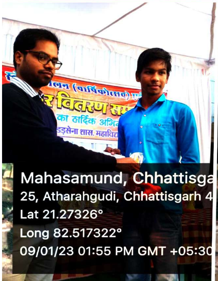
Mahasamund, Chhattisgarh 25, Atharahgudi, Chhattisgarh 4 Lat 21.27326° Long 82.517322° 09/01/23 01:55 PM GMT +05:30