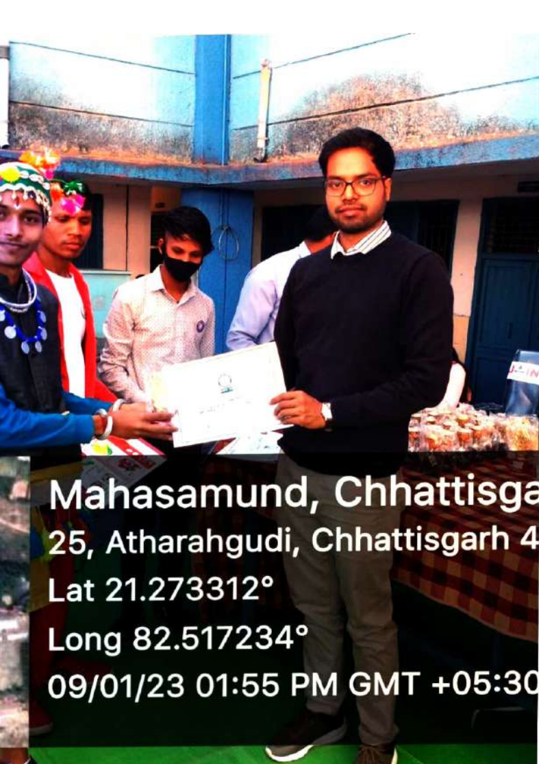
Mahasamund, Chhattisgarh 25, Atharahgudi, Chhattisgarh 4 Lat 21.273312° Long 82.517234° 09/01/23 01:55 PM GMT +05:30