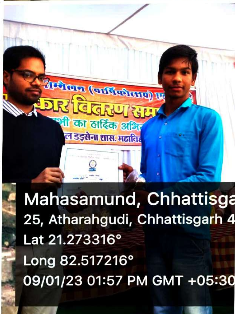
Mahasamund, Chhattisgarh 25, Atharahgudi, Chhattisgarh 4 Lat 21.273316° Long 82.517216° 09/01/23 01:57 PM GMT +05:30