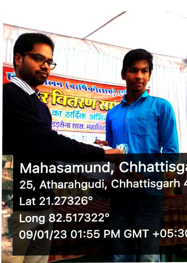
Mahasamund, Chhattisgarh 25, Atharahgudi, Chhattisgarh 4 Lat 21.27326° Long 82.517322° 09/01/23 01:55 PM GMT +05:30